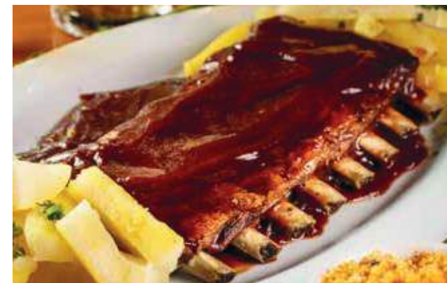
Outback Steak House