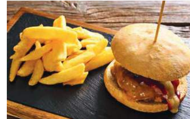
Madero Steak House